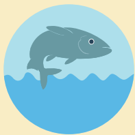
Improvement of Fish Spawning