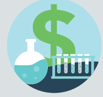
$262-$314 Million Science & Structural Habitat Fund

Public water agencies, state and local government agencies and the conservation community are ready to act. Funding for fish and wildlife water supplies, habitat restoration projects and science programs will come from a variety of sources. This will include funds from public water agencies and their water users. Total estimated water user contributions to a Water Revolving Fund are projected to be $425 million. Total estimated water user contributions to the Science and Structural Habitat Fund will range from $262 to $314 million. In support of this initiative, Gov. Newsom and the legislature recently set aside $70 million in the 2019-'20 fiscal year state budget for habitat restoration actions and other measures for the Voluntary Agreements.