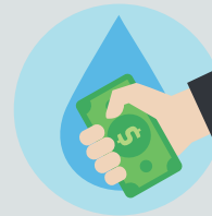
$425 Million Water Revolving Fund