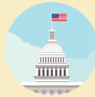
Federal & State Government