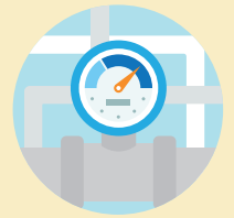
Public Water Agencies

The development of Voluntary Agreements relied on engagement from multiple parties involved in water supply, regulation and environmental protection. Implementation of these agreements will establish a 15-year partnership among federal, state and local government, conservation groups and other stakeholders.