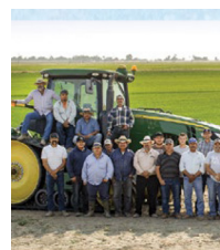
2019 River Garden Farms