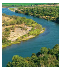
2016 Sacramento River Settlement Contractors