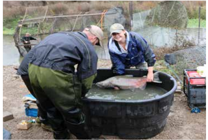
2014 Winter-run Salmon Rescue Efforts