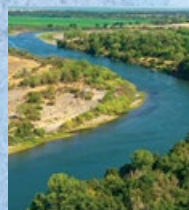
2016 Sacramento River Settlement Contractors