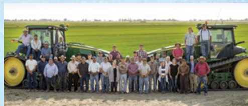
2019 River Garden Farms